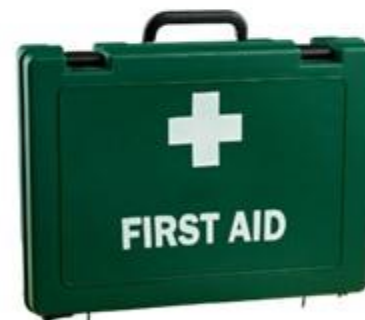
first aid kit

Do you know what all these things are? How do you think they will help us in an emergency?