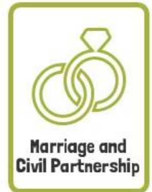
Marriage and Civil Partnership