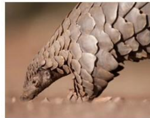
Pictured: Giant pangolin searching for termites.

What animal can curl into a ball and is covered in scales? It's a pangolin! An incredibly rare type of pangolin has been spotted in Senegal, Africa, for the first time in 23 years. The giant pangolin is endangered, which means there are not many of them left. One of the main reasons for this is poaching. Their meat is considered a delicacy in many parts of Asia and Africa and their scales are sought after, so the animals are hunted and trafficked. These adorable animals are easily caught, as their response to danger is to simply curl up and wait, which means they can just be picked