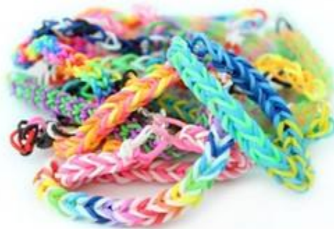
Loom band bracelets.