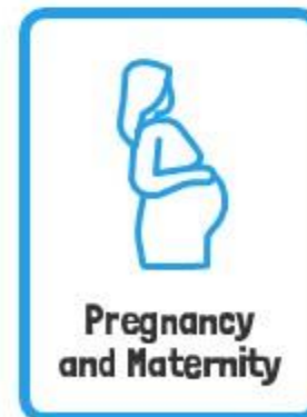
Pregnancy and Maternity