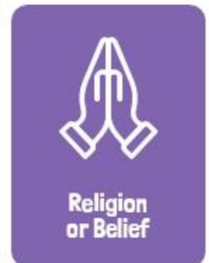
Religion or Belief