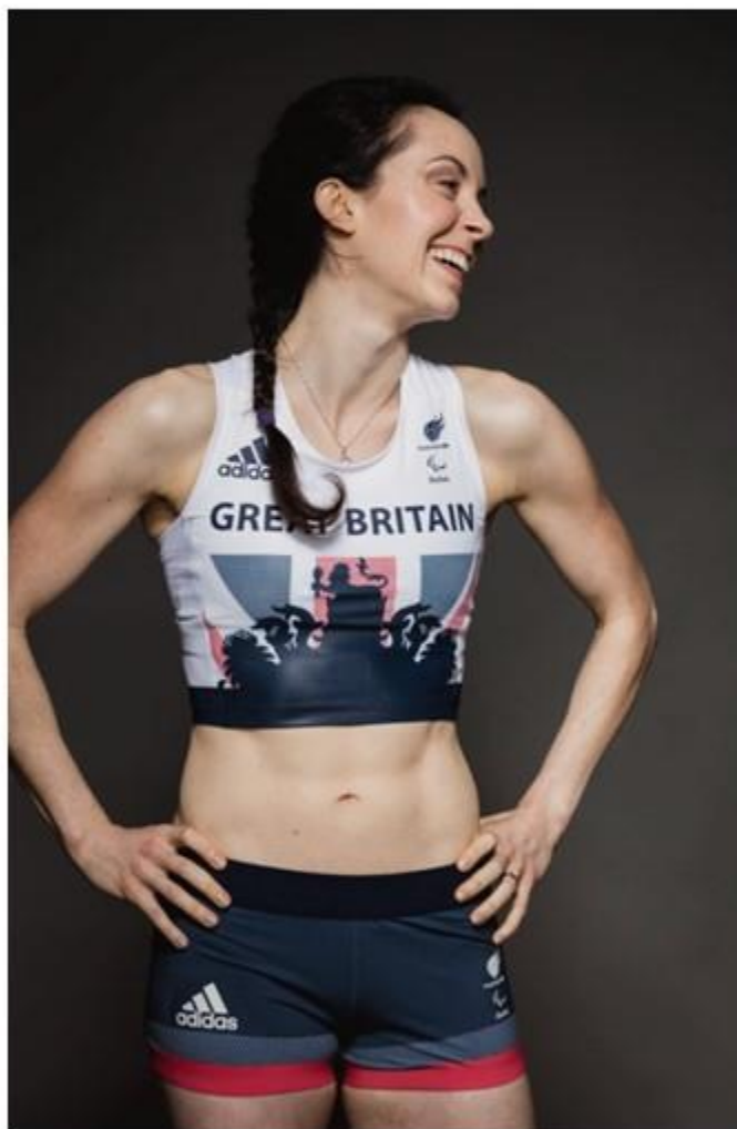
Pictured: Stef Reid representing GB in the previous Paralympics.