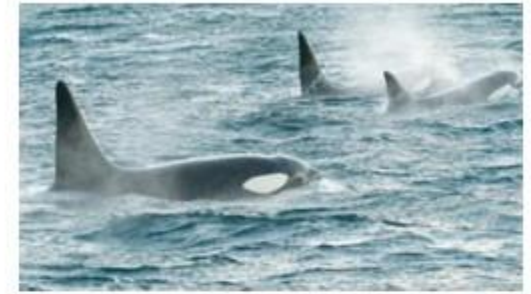
Pictured: A pod of orca whales.

Reports have recently highlighted an issue that orca whales seem to be attacking small boats and fishing vessels off the coasts of Spain, France, Morocco and Portugal. The whales have intentionally collided with nearly 700 boats, causing at least seven of them to sink and damaging many others. While orca are known to work in groups to hunt prey, they are rarely aggressive towards humans, so the behaviour is puzzling for experts. A team of marine biologists has been observing a pod (group) of whales and they are beginning to believe