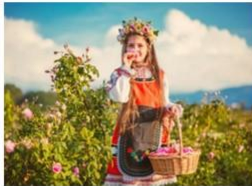
Pictured: Picking roses in the Rose Valley, Bulgaria.

all the hard work that goes into cultivating these pretty flowers. The roses are very delicate so even slight changes in weather can easily ruin them. The flowers must also be picked before lunchtime to avoid the heat of the sun drying out the precious petals. Three main events make up the festival itinerary - the electing of Queen Rose, the harvesting ritual in the rose gardens and the parade along the streets of the town.