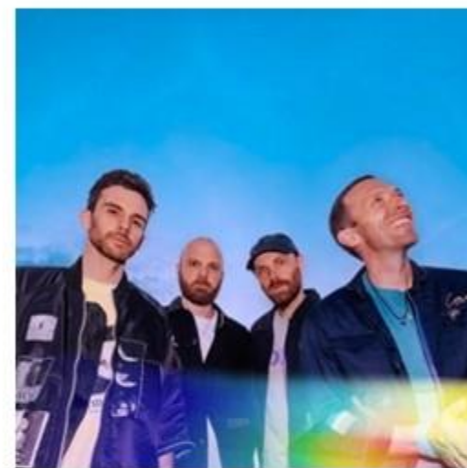
Pictured: Coldplay.

Coldplay's new album is going to be their most eco-friendly album yet - made from recycled plastic collected from rivers! Coldplay, working with Ocean Cleanup, have announced that when their 10 th record is released in October, the vinyl copies will each be made from nine recycled plastic bottles. The British rock band's upcoming album, Moon Music, will be a world-first for sustainable vinyl production. Coldplay are one of the best-selling music acts of all time, with over 100 million albums sold globally. This is not the first time that the band have considered their impact on the environment. They actively reduced the carbon footprint of their last tour by making changes to be more environmentally friendly, such as, using solar powered lights and sustainable aviation fuel.