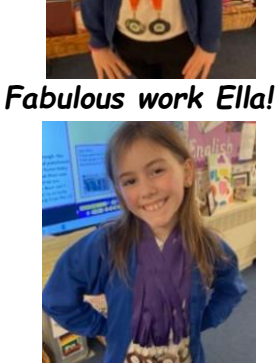
making cookies and hot chocolate for the Café.