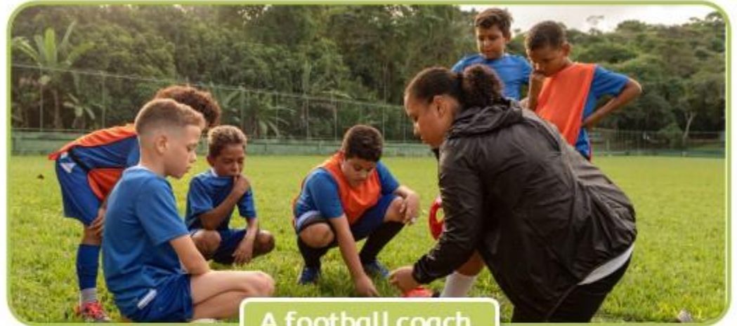
A football coach.