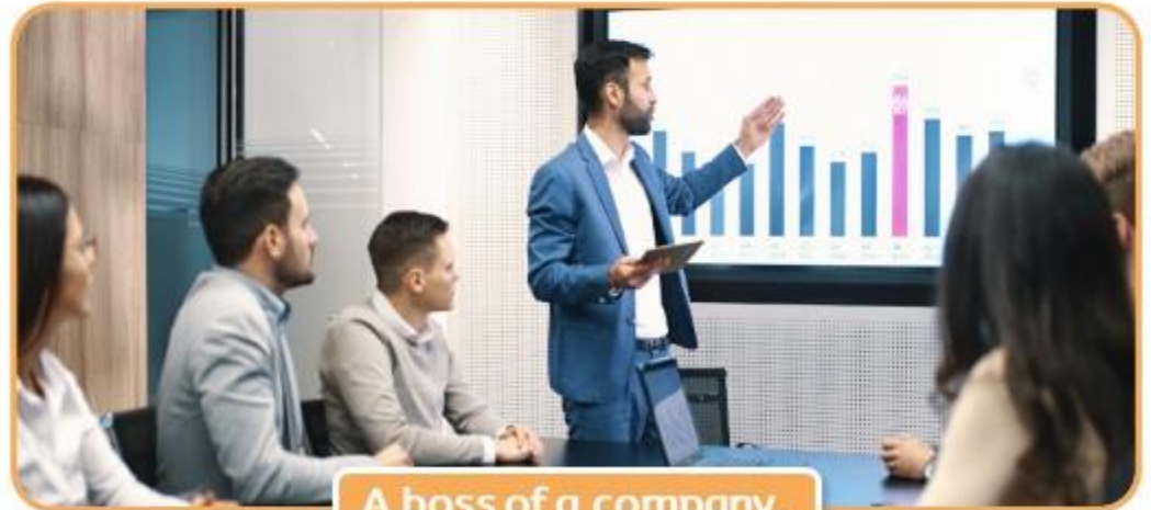
A boss of a company.